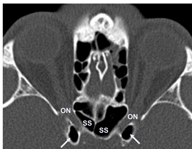
Fig. 3. Axial CT image showing bilateral pneumatization of the anterior clinoid processes (arrow) and bilateral optic nerves (ON) inside sphenoid sinus (SS).

DeLano et al. 3 reviewed 150 CT scans – 300 nerves, which all were intimately related to the sphenoid sinus. Only 3 % were in contact with the posterior ethmoid cells (PEC). They reported – type 1 – 76 %, type 2 – 15 %, type 3 – 6 % and type 4 – 3 %. Sapci et al. (2004) observed type 1 – 64 %, type 2 – 22 %, type 3 and 4 are both 7 % of the total number. They reviewed 100 CT scans. Li et al. 7 found whole optic canals neighboured with PEC, SS and both in 39 %, 43 % and 18 % of cases, respectively. They reported the bulgings of optic canal into the lateral wall