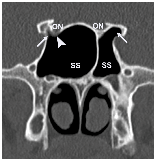
Fig. 2. Coronal CT image showing bilateral pneumatization of anterior clinoid processes (arrow), protrusion of right optic nerve (ON) in sphenoid sinus (SS) and dehiscence (arrowhead) of the bony wall of ON on the right side.

the left side. Table 2. shows the prevalence of ON protrusion, dehiscence of the bony wall and pneumatization of ACP.