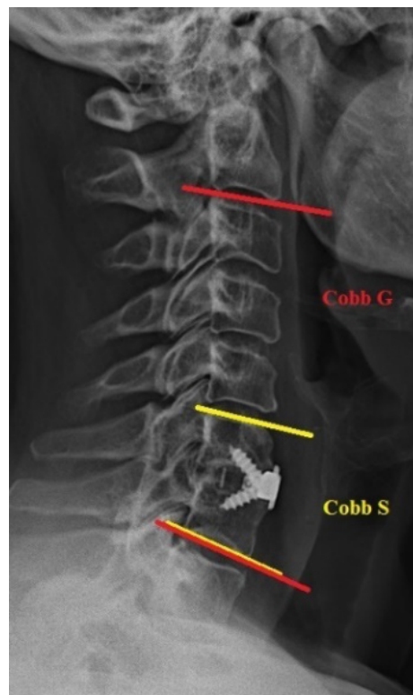
Fig. 2. The method of evaluation of CobbS and CobbG.

were then evaluated as the difference between CobbS (CobbG) values in the preoperative and early postoperative period (up to 48 h). Differences in SSP and GSP during the further postoperative period were evaluated as the difference between CobbS (CobbG) values in the early postoperative period and CobbS (CobbG) values over 6 weeks, 3 months, 6 months, 12 months and 24 months after ACDF. Statistical significance of factors such as age, gender, number of operated motion segments and osteoporosis was evaluated using Student's unpaired t-test. The impact of the cage subsidence (CS) on CobbS value in term of 24 months after ACDF was evaluated using the same test. Correlation between SPP and GSP changes was assessed by means of the Pearson's correlation coefficient ( r ). The Cohen scheme was used to interpret Pearson correlation coefficient - absolute values up to 0.1 represented a trivial correlation, values between 0.1 - 0.3 represented a weak correlation, values 0.3 - 0.5 represented a moderate correlation and values above 0.5 represented a strong correlation 1 .