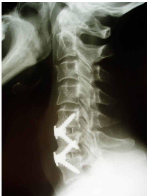
Fig. 1. Lateral X-ray after ACDF with Zero-P VA® cage in levels C5-6, C6-7.