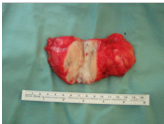
Fig. 4. Image of the excised tumour. The black spots inside the tumour correspond to small cystic areas.

modality findings a core cut biopsy was demanding and was performed under USG control after a consent was received from the patient following which the samples were then send for histological analysis. Histological diagnosis was determined by two pathologists with 10–20 years of experience in breast histology. MRI (magnetic resonance imaging) was also done as advocated by the surgeon to get a better picture of the extent of the lesion. MRI – native, T2 TSE, STIR and T1 fat saturation sequences in transverse and coronal plane were also performed. MRI was done using Siemens Symphony, Erlangen, Germany, Siemens. 1.5 Tesla under breast array coil. Finally, the clinical, radiological and histological reports were thoroughly analysed. A tumour excision was recommended and the tumor area was approached by an incision made at the periareolar region.