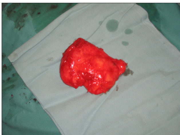
Fig. 3. The whole tumor after surgery. The tumour is encapsulated and is of lobulated shape.